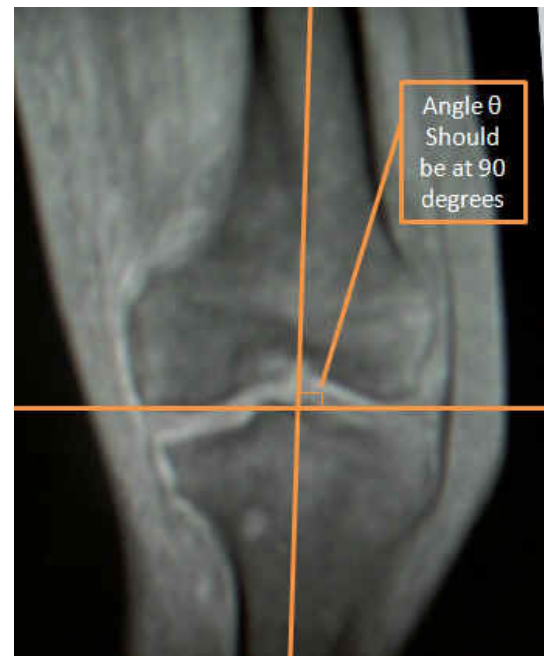
Figure 3 – Coronal Localizer

Knee joint centered to FOV showing equal portions femur and tibia. Line drawn parallel to distal femoral condyles is perpendicular to slice position. Slice coverage from R/L covers all knee bone anatomy.