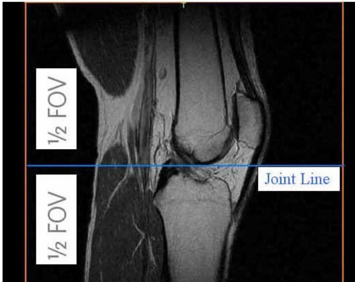
Figure 1 – Sagittal Localizer

The patient should be placed in the coil so that the resulting image has equal amounts of femoral and tibial shaft. Due to effective coil coverage some coil cut-off is expected but, this cut-off must be equally distributed and the joint space should be centered in the Field of View, (FOV). Please use sandbags, foam etc. to achieve this. This is essential to avoid patient motion on the resulting images.